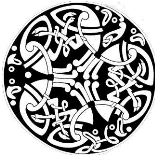
Bas Sona! Traditional Irish

Due to the anticipated volume of applications, early application is encouraged! All applications must be received by the Sacred Art of Living Center no later than June 30, 2022. Tuition structure reflects Early Bird rate as well as late application fee increases. Notice of acceptance will be given within a reasonable time after reception of completed application and references .